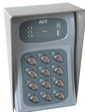
ACT 10 Weather Shield