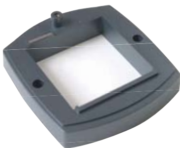
Surface Mount Collar