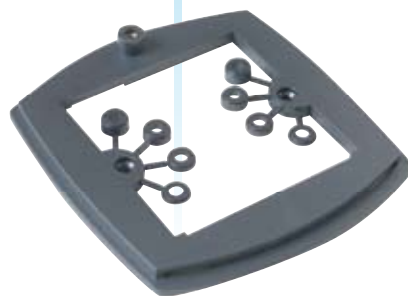
Flush Mount Plate