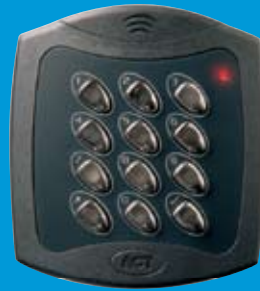
ACT 5 Digital Keypad