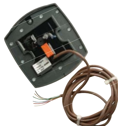
ACT 5 Keypad with lead (3m)