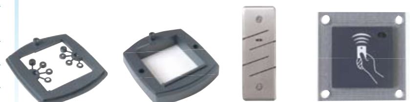
Flush mount plate