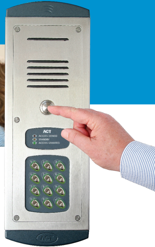
ACTentry A10 Door Entry Panel