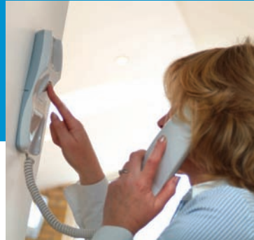
ACTentry A10 Door Intercom Handset